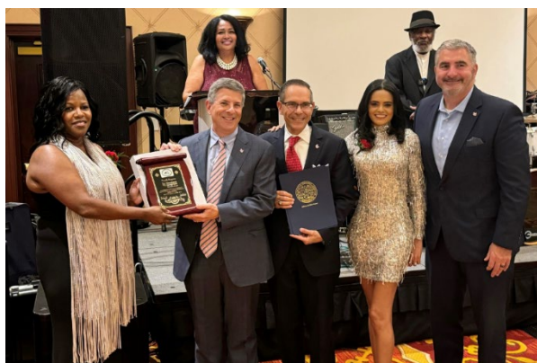
WIAAGB presenting award to Newtown Savings Bank

The West-Indian American Association of Greater Bridgeport recently recognized Newtown Savings Bank with the Corporate Citizenship Award at their Annual Scholarship Banquet. We proudly support WIAAGB's mission of expanding opportunities for all and promoting Caribbean culture and education.