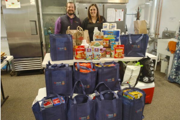
Employees dropping off donations at Bethel Community Food Pantry.

Thank you to everyone who contributed to our food drive. It was a great success and we couldn't have done it without your help.